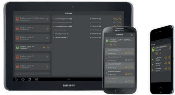
TOSIBOX® Mobile Client App is available for Android and iOS devices.

TOSIBOX® Mobile Client gives you secure and easy remote access on the go by enabling secure VPN connections to matched TOSIBOX® Lock devices, using the mobile device's Wi-Fi or mobile data connection. TOSIBOX® Mobile Client is built on the physical security foundation of TOSIBOX® products: the access rights are granted and controlled from the physical TOSIBOX® Key, after which the Mobile Client remains bound to it. The access rights are device-specific and non-transferrable.