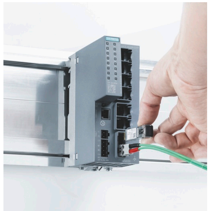
SFP slots (small form-factor pluggable) allow the SCALANCE X switches to be flexibly fitted with transceivers.

Well-known for automation and proven in the field of industrial network technology, Siemens offers the right network solution for every level described above. For smaller machine networks, the integrated switching functionality can be utilized, or unmanaged switches can be used for machine-oriented networking. To handle larger networks, greater functionality and more comprehensive diagnostics are required, which is offered by the SCALANCE XC-200 in the form of an Industrial Ethernet layer 2 managed switch. Different port characteristics for electrical RJ45 as well as optical connections are available. By using SFP slots (small form-factor pluggable), the switch provides a flexible way to connect optical participants – in addition to the fixed optical transceivers with SC and ST/BFOC connection technology. Depending on the bandwidth and range required, the switch can be equipped with a wide selection of optical transceivers. Another advantage of the SFP variant is its configuration with SFPs with up to one Gbit/s, e.g., for the setup of fast gigabit connections when networking multiple cells (shop floor aggregation).